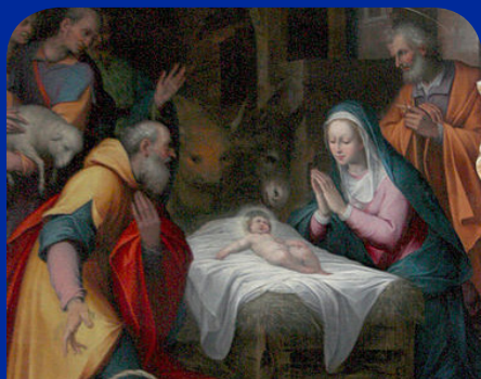
Detail from Nativity by Camillo Procaccini (1596)