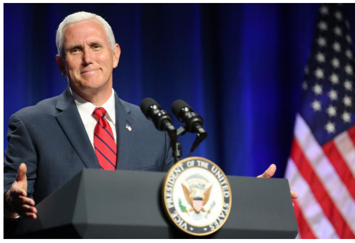
Vice President Mike Pence spoke at the Prayer Breakfast: "Remember to bow the head and bend the knee to pray in these challenging times."

WHAT'S INSIDE: A NEW VISION OF CATHOLIC HEALTH CARE P. 1-2