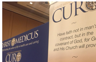
The Christ Medicus Foundation and CMF CURO gained exposure as the main sponsor of the Prayer Breakfast.