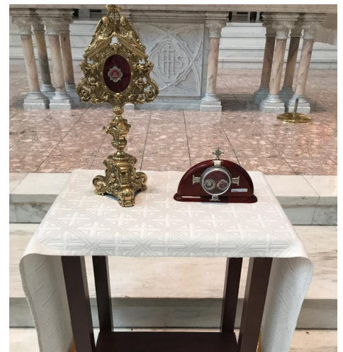
From left: The CMF CURO sponsorship of the Focus Alumni Go Forth event; the Cathedral Basilica of the Immaculate Conception in Denver; the relics of St. Padre Pio in the Cathedral in Denver.