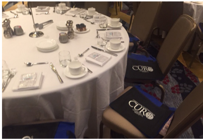
CMF CURO attended and was the main sponsor of the National Catholic Prayer Breakfast in early June in Washington D.C.